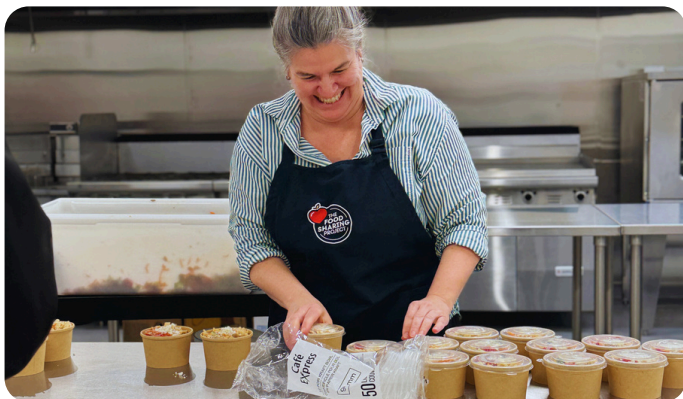
One of the dedicated staff at the Food Sharing Project.

While direct financial support is a priority, we are also working to lower the costs of food before it reaches store shelves: